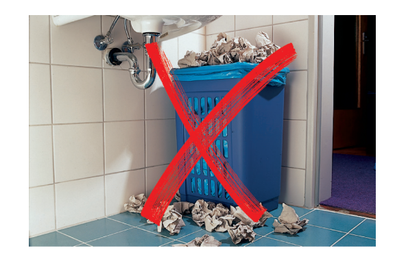
No more paper towel costs or messes.