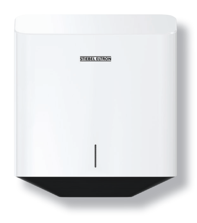
Ultronic™ Plus Alpine White Polycarbonate