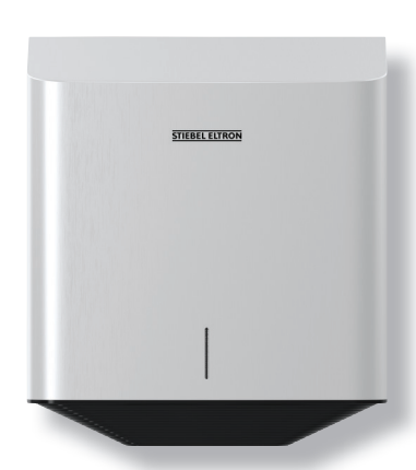
Ultronic <sup>™</sup> Premium Stainless Steel